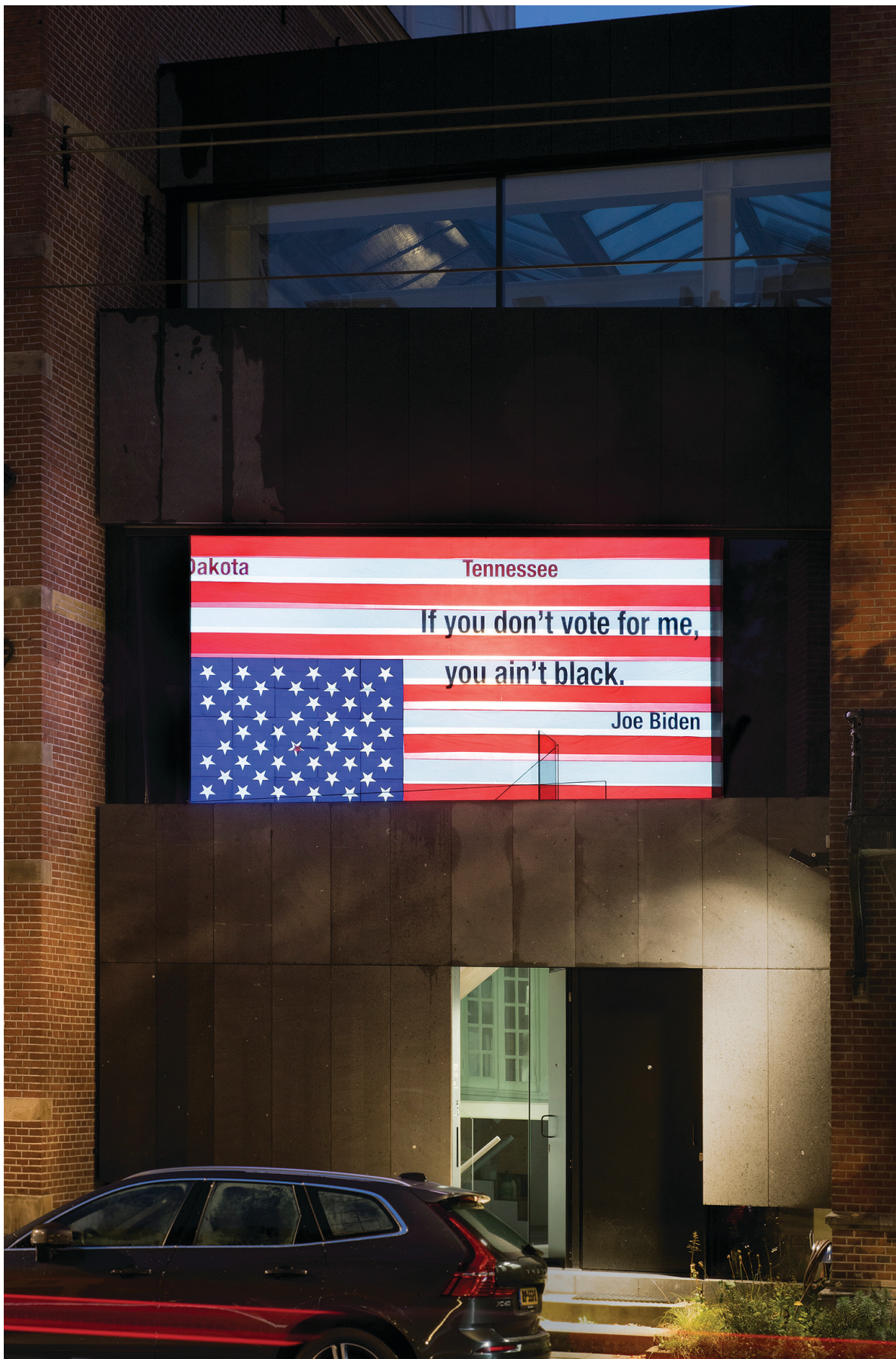
J&B, THE DIVIDED STATE OF AMERICA , 2020